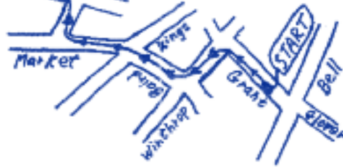
Heroes to Hero 5K Course Map (not to scale)

Buses will transport you to the starting line at the Mt. Ephraim Fire Dept. ALLOW TIME FOR THIS PROCESS... Late Entry & Packet Pick-up CLOSES in Gloucester City at 8:30am! Last bus to start will leave at 8:30am Sharp!